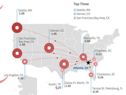
Cities that Atlanta Has Lost the Most Workers To Rate per 10,000 Members

The South is the fastest growing region in the country.